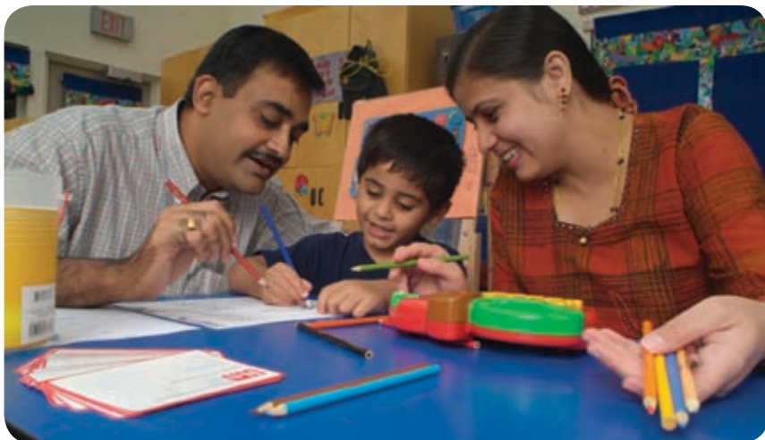
A family at the University of Guelph Child Care and Learning Centre.

There are two (formal) childcare services available on campus: