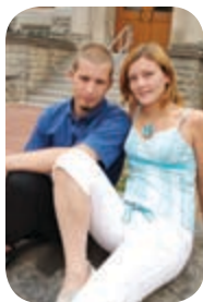
Food Science graduate students.