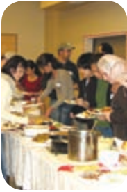
Conversational ESL graduation banquet