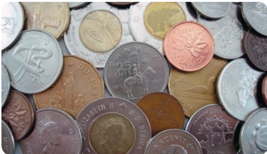
A handful of Canadian coins.