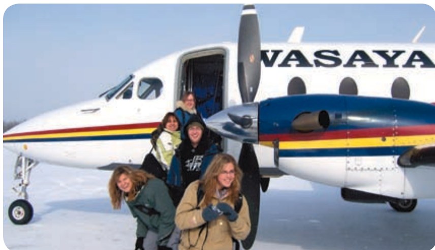
Guelph students on a trip to northern Ontario during a Reading Week service and learning program called Project Serve.

have the appropriate visas to enter and reside in Canada by inquiring at the Visa Office in your home country.